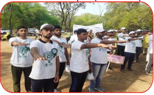
World Environmental Day (5-6-2023)